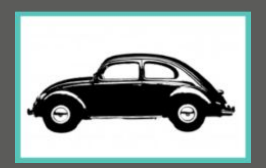
<u>PARKING</u> Parking lot is not available.