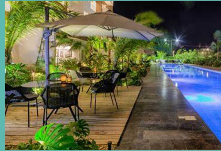
Central park and pool

This building is just one of the many that make up the Vía Montejo complex in Mérida, they have a Central Park that resembles the iconic central park in New York, where you can spend an extraordinary day with your family.